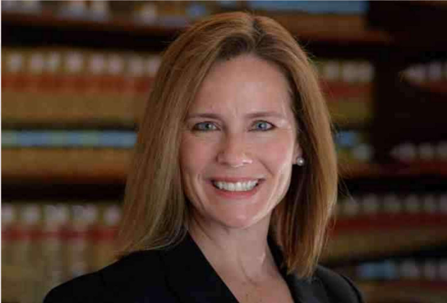
Judge Amy Coney Barrett