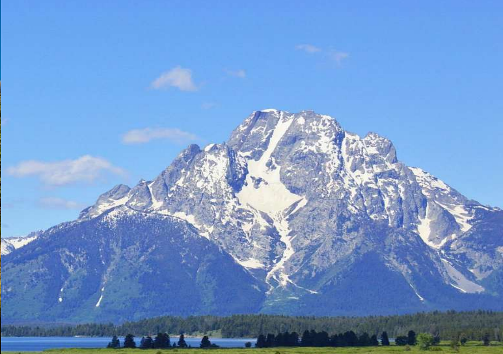
Grand Teton National Park, Wyoming