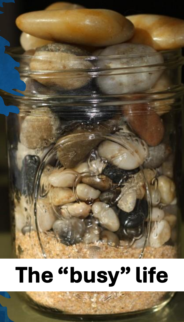
The “busy” life