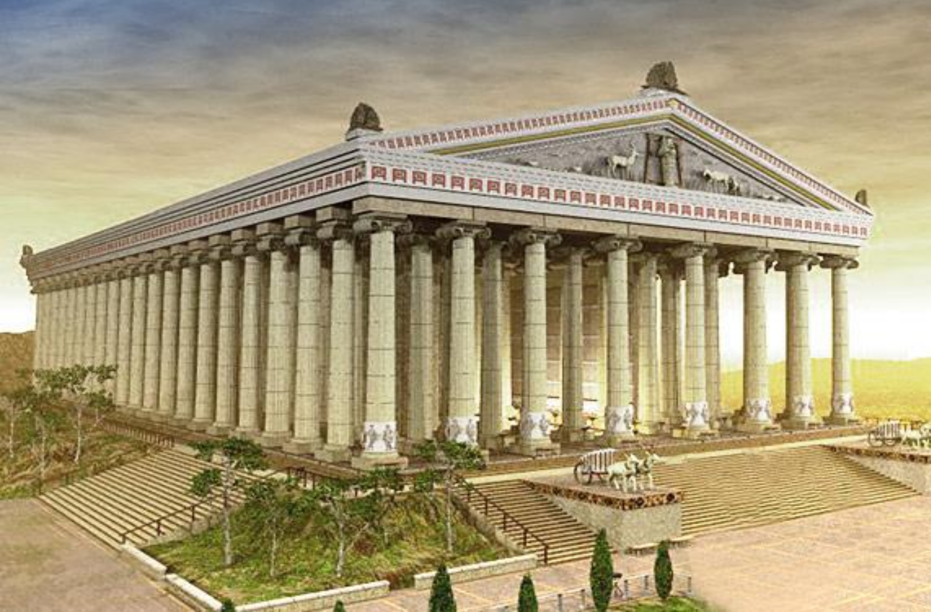
TEMPLE OF EPHESIANS (Artemis, Diana)