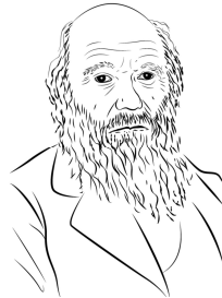
Even Darwin is a believer now.

P.O. Box 447 201 W. Chestnut Street Rogers, AR 72757 479-636-3575 www.downtowncoc.net