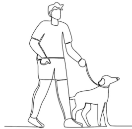
G-O-D Man's True Best Friend

P.O. Box 447 201 W. Chestnut Street Rogers, AR 72757 479-636-3575 www.downtowncoc.net