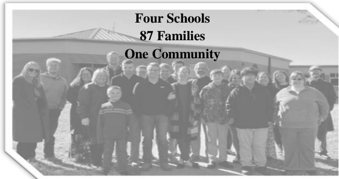
Four Schools 87 Families One Community