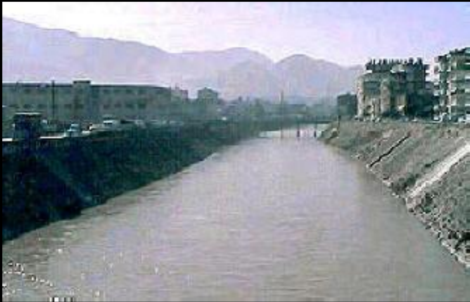
The Orantes River