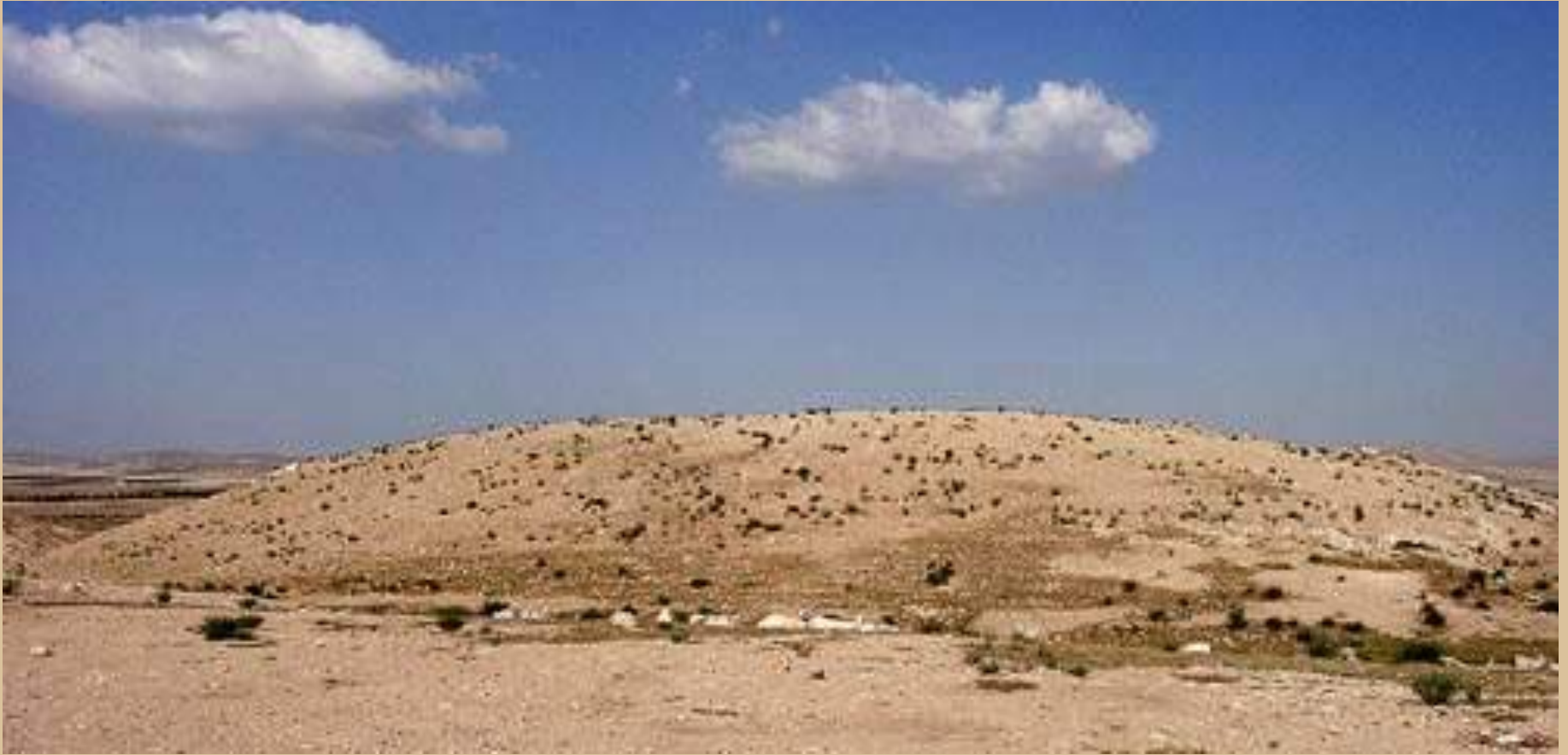
Tel Ar-Rumeith