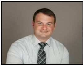
Scott McFarland Minister